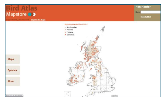
Figure 2: Typical map detail

In addition to technical data, the 'Map' link in Table 1 will enable further confirmation of likelihood of presence in a given locale using breeding distribution maps (Figure 2).