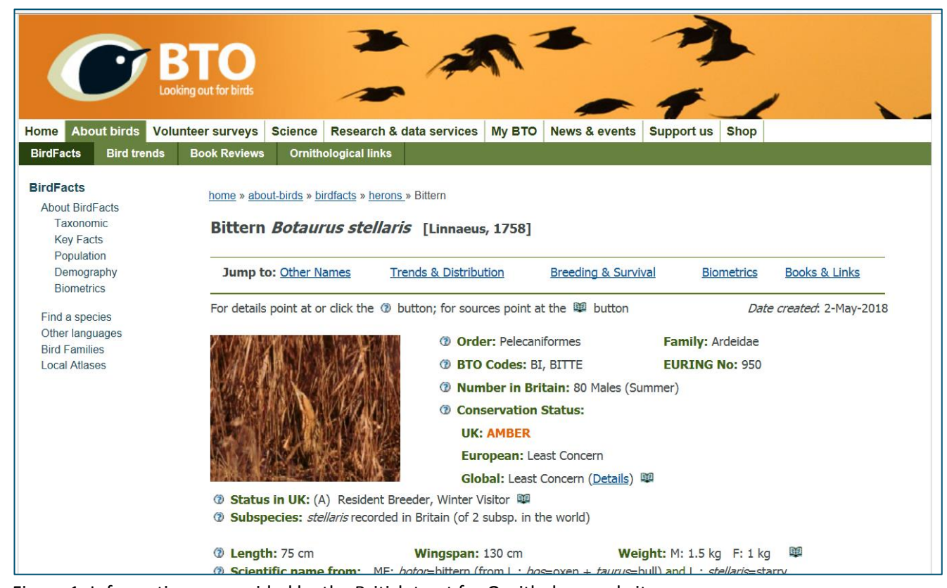
Figure 1: Information as provided by the British trust for Ornithology website

Local knowledge, discussions with local groups and stakeholders alongside any environmental checks carried out internally will identify the potential presence of Schedule 1 bird species. Using the link in Table 1 for 'Info', the likelihood of that species being present can be determined given species range and conservation status (Figure 1).