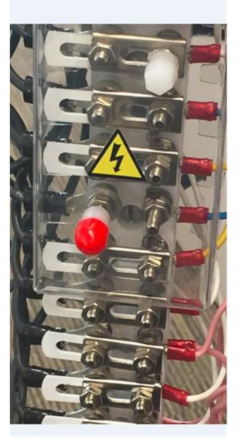
Shroud fitted to 2BA links

Note 'should' (on the previous slide) as it's unusual to prescribe all the supporting component piece parts of an electrical installation in the design since these details are given elsewhere in supporting NR Standards such as BRS-SM 440 drawings or The Signalling Installation Handbook.