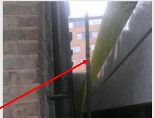
Wrap and bitumen coating