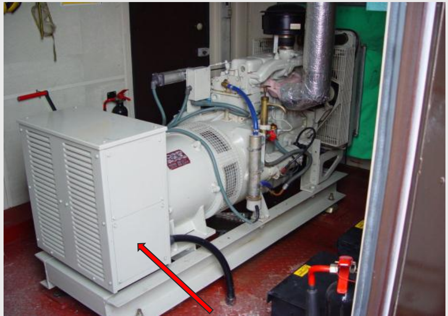
Diesel Alternator Sets