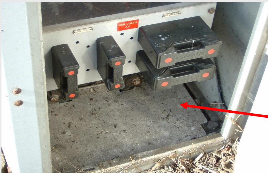
Asbestos Base Board