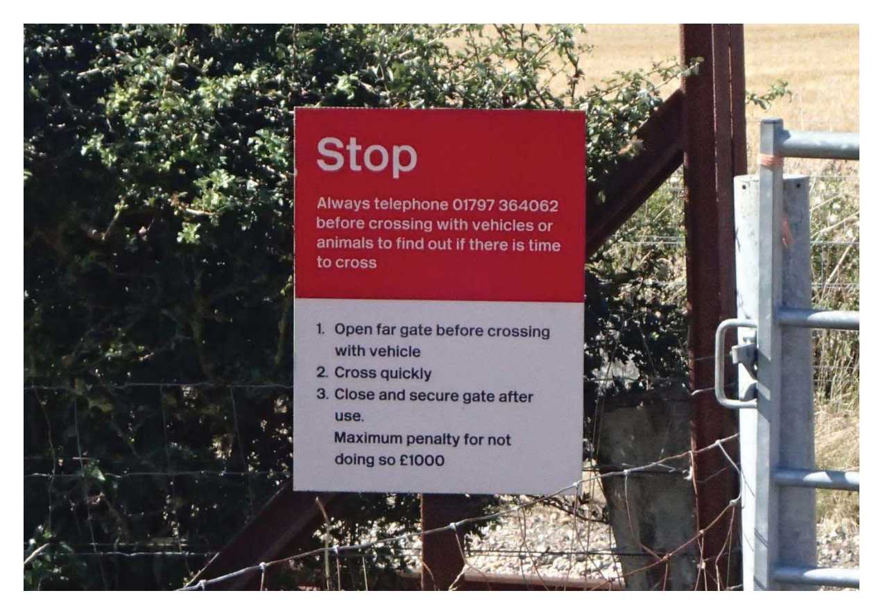
One of the signs displayed on either side of the crossing, which give users instructions on how to cross

The RH&DR had not briefed the authorised user of this UWC in recent years and had no record of doing so earlier. The method described on the sign had not been briefed to the tractor driver by either his employer (a contractor working for the farm occupier), or by the farm occupier.