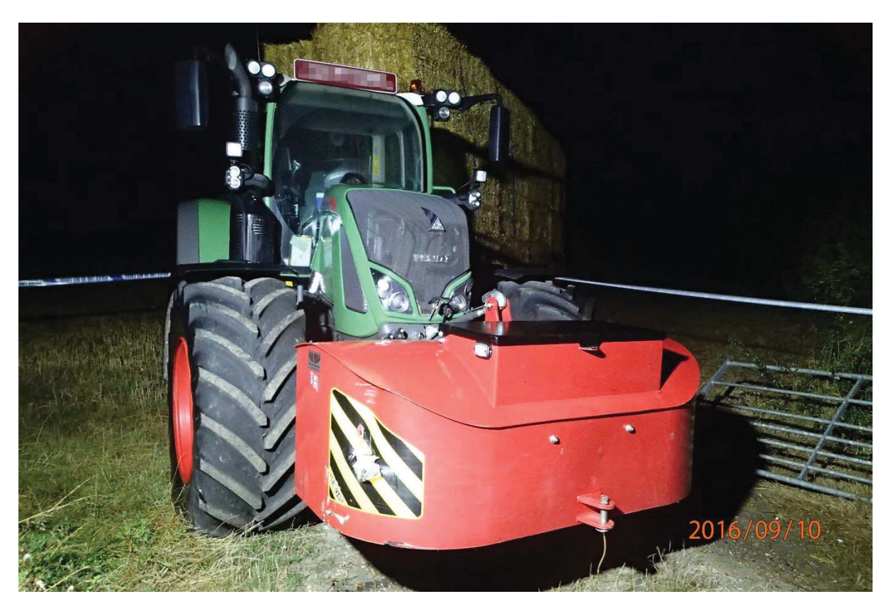
The tractor involved in the accident. The train hit the red counter-weight attached to the front

The impact caused the steam engine and its tender to derail and tip onto their lefthand sides, coming to rest approximately 23 metres beyond the crossing. The first coach of the train was also derailed but remained upright. The front of the tractor was pushed sideways into the crossing gate and post.