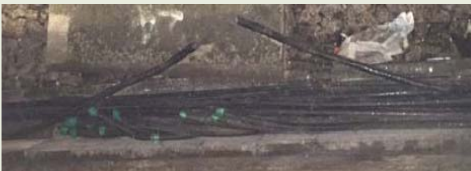
Photograph showing cable that was cut and 'Green Ended' cables ready for removal