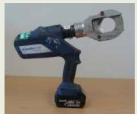
Hydraulic Cable Cutter