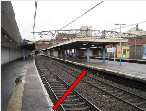
Radio, Leaky feeder cable