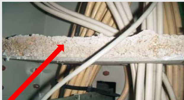
Insulating board with non-asbestos sprayed coating