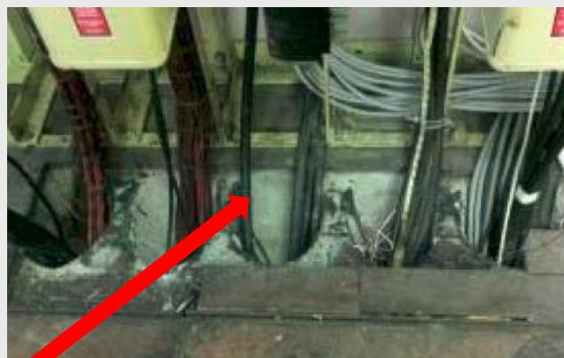
Paper insulation / cable sleeve