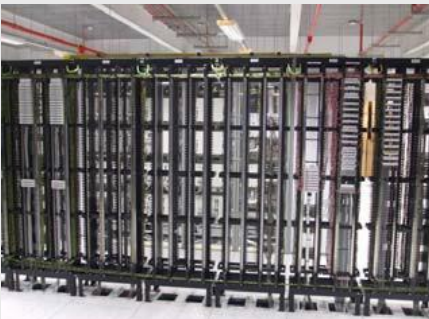
MDF (Main Distribution Frame) (CM 120RTK0002) Used to manage main cable terminations, for example where external cables enter an operational building

If equipment is working generally cable distribution frames are not inspected and are not checked directly, only if there are known issues or prior to upgrading projects.