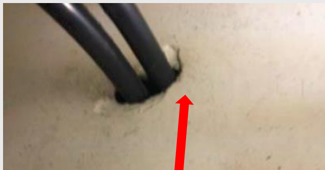
Cables through insulating board