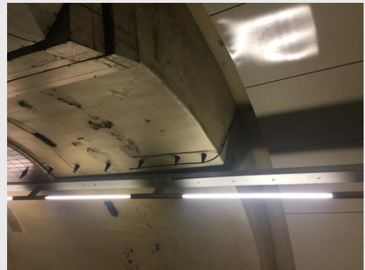
Radio, Leaky feeder cable