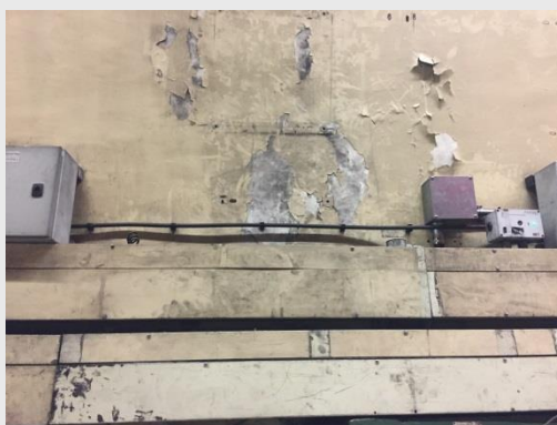
Radio, Leaky feeder cable