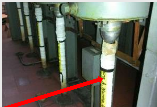
Cable wrap / bitumen