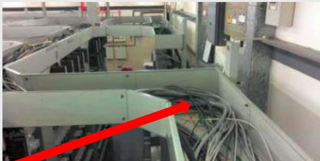
Debris within cable trays