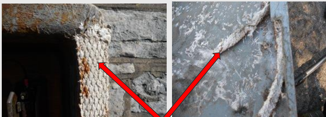
Asbestos Rope seals