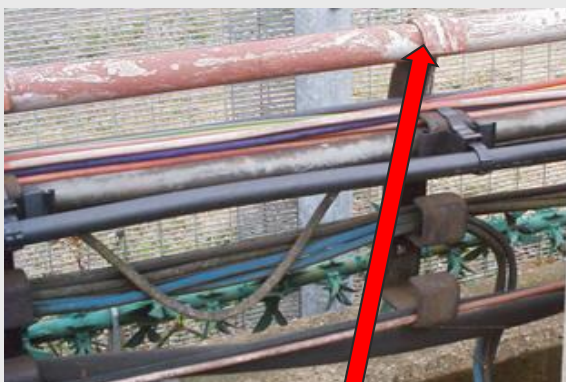
Packing to cable hangers