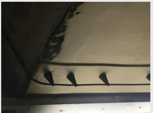
Radio, Leaky feeder cable brackets