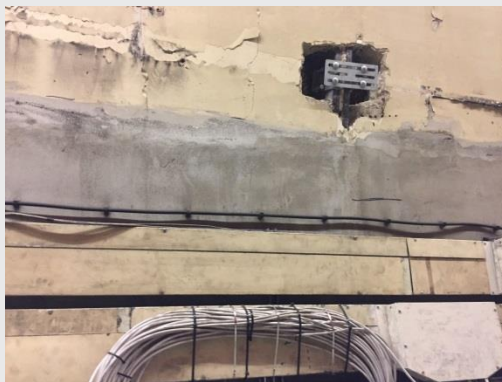
Radio, Leaky feeder cable