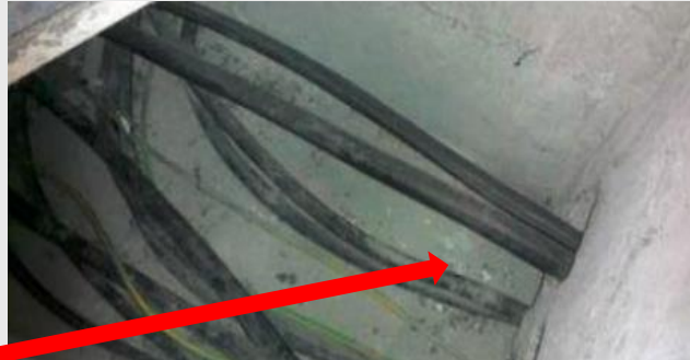
Debris within ducts