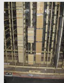
IDF (Intermediate Distribution Frame) (CM 120RTK0003) Used to manage interconnections between an MDF and internally networked equipment within operational locations.