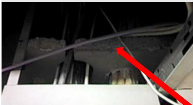
Insulating board with non-asbestos sprayed coating