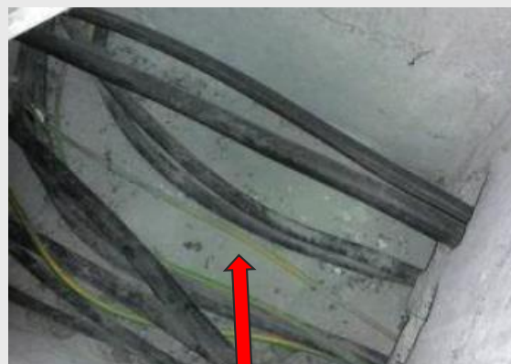
Cable run with dust/debris