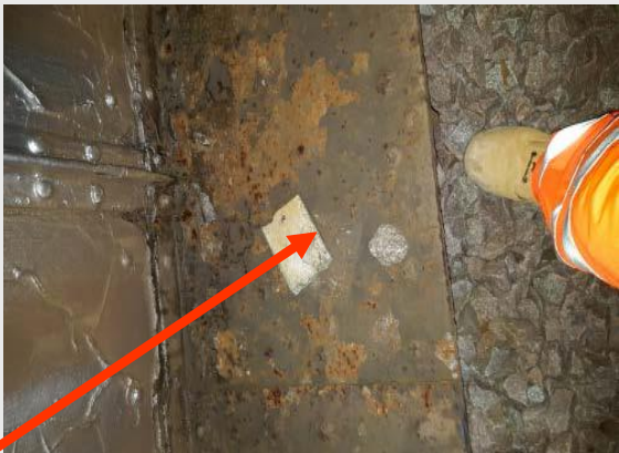
Cement debris to lineside