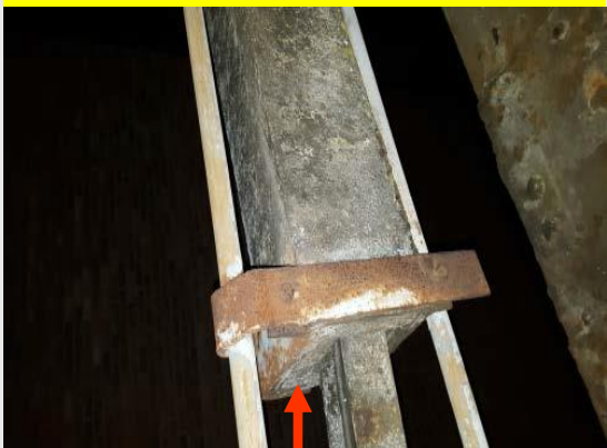
Cement conduit with attached junction box