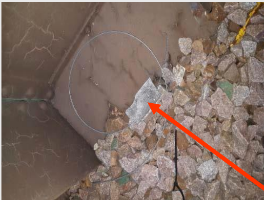
Cement debris to lineside