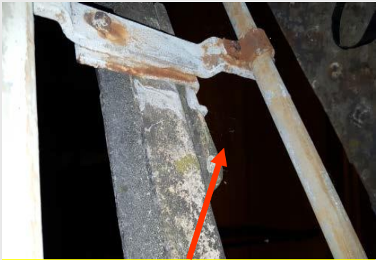
Cement packers beneath cement conduit