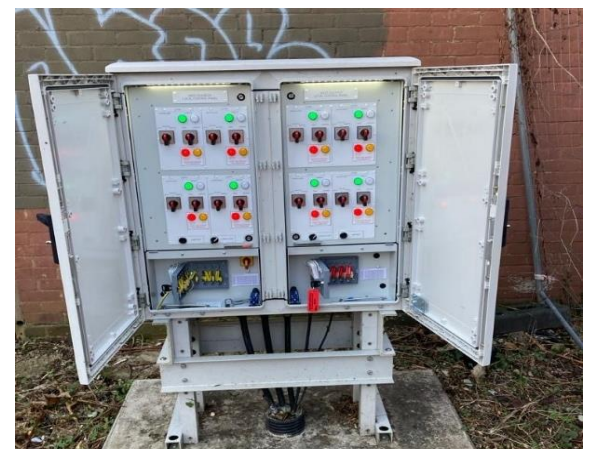
LOCATION OF LCP