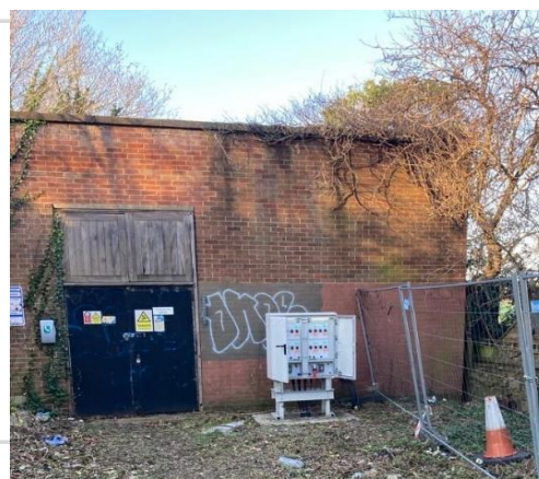
PEDESTRIAN ACCESS ROUTE