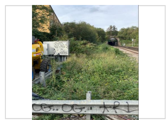
LOCATION OF LCP