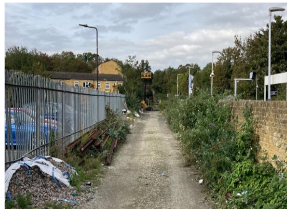
PEDESTRIAN ACCESS ROUTE