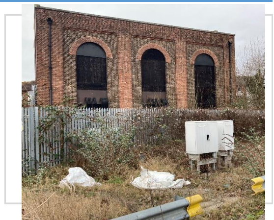
LOCATION OF LCP