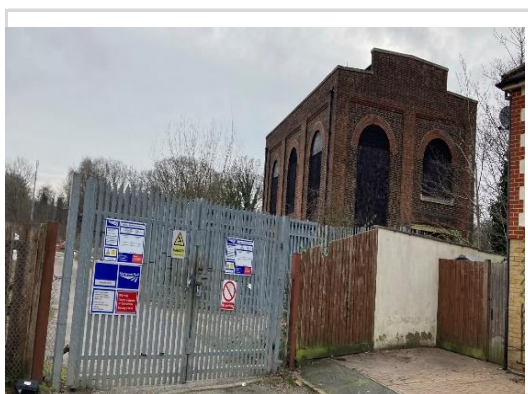
PEDESTRIAN ACCESS ROUTE