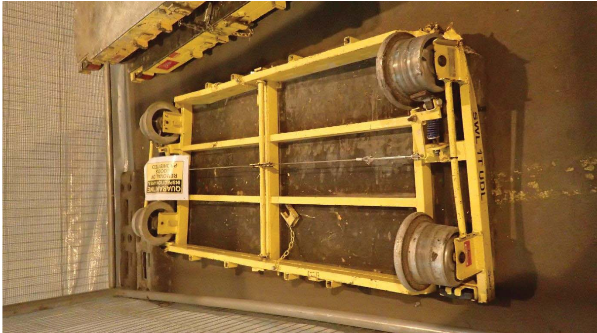
The engineering trolley found between the Up Main line and the Down Main line

The train was examined that night at Longsight depot, Manchester, where further damage was found to underframe and bogie-mounted equipment. The discovery of this damage was reported by Virgin Trains to Network Rail at 08:05 hrs on Thursday 8 December 2016. Subsequently, damage to the body side of train 9G11 was also found, but it cannot be confirmed that this damage was also caused by the collision with a trolley in the tunnel.