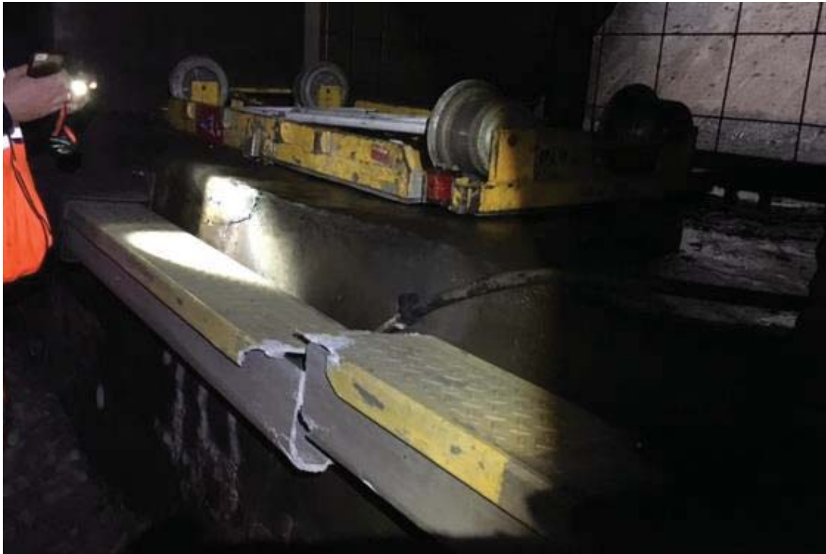
Undamaged trolley as found within the pressure relief shaft No. 1 recess in Stowe Hill Tunnel. The metal grille at the bottom of the shaft can be seen in the background