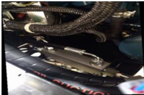
New position of over centre valve