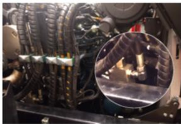
Old position of over centre valve