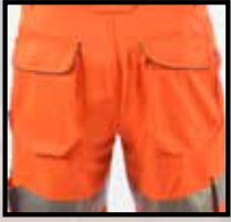
Velcro fastened pocket