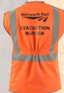
Evacuation Warden Vest Ref: NRG200RT/EW