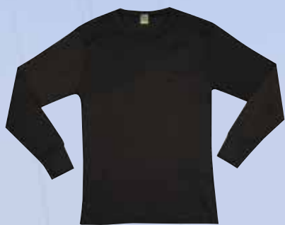
Thermal Long Sleeved Undershirt