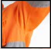
Reinforced with rivets on all pressure points