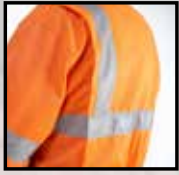
Action back for greater movement