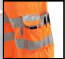
Mobile phone inc pen pocket