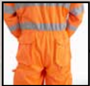
Elasticated back with 2 rear pockets