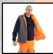
Completely reversible inc grey inner