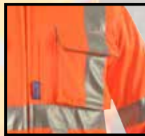
3D chest pocket inc pen pocket