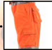
Cargo pocket on leg inc Access and hand pocket to trousers