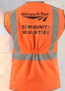
Community Volunteer Vest Ref: NRG200RT/CV