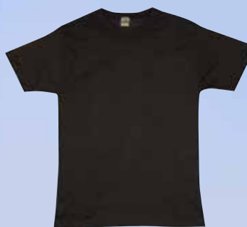
Thermal Short Sleeved Undershirt