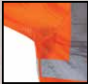
Under arm ventilation