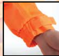
Adjustable velcro fastened cuff