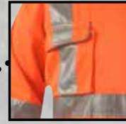
2 chest pockets