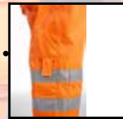
Ruler/knife pocket on leg