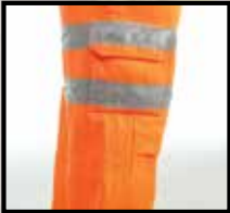
3D cargo pockets