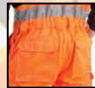
Rear cargo pockets