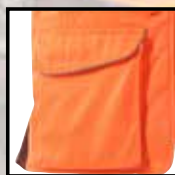
3D cargo pockets