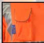
Mobile phone pocket