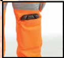
Knee pad pockets