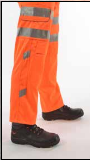
Side chevron protection