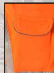
Mobile phone pocket