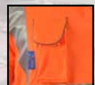
Mobile phone pocket