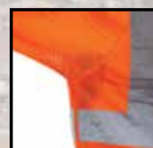
Under arm ventilation