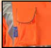
Mobile phone pocket