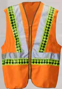
RIO Vest Ref: NRG200RT/RIO