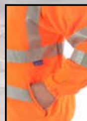
Zipped hand pocket