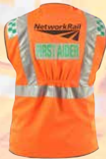
First Aider Vest Ref: NRG200RT/FA