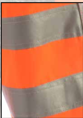
Twin needle stitching