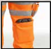
Knee pad pockets (pads not inc)