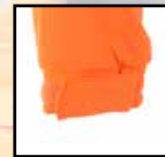
Velcro adjusted cuff