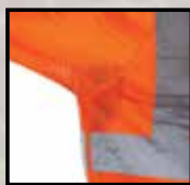
Under arm ventilation