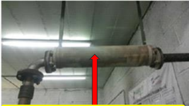
Paper lining under non-asbestos insulation