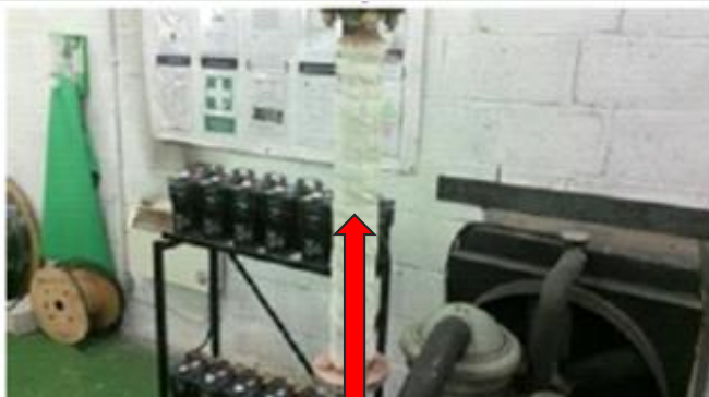
Wrap to exhaust