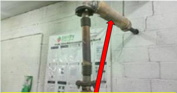
Paper lining under non-asbestos insulation