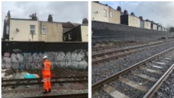
Before and after graffiti clearance at Harlesden

Join organisations that have signed the Rough Sleeping on Rail Charter and take action to support people at risk of homelessness around our stations.