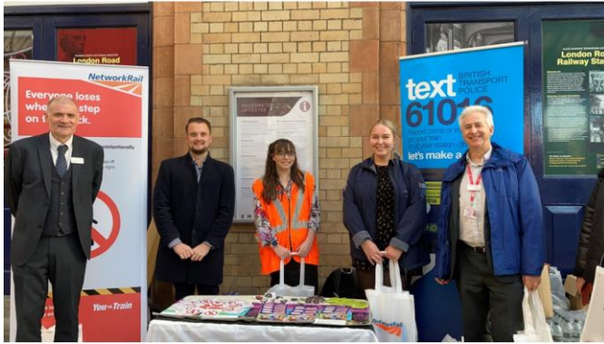
Trespass and Vandalism community event, Leicester station

Visit schools to provide safety education to young people. Use our educational resources to do so.