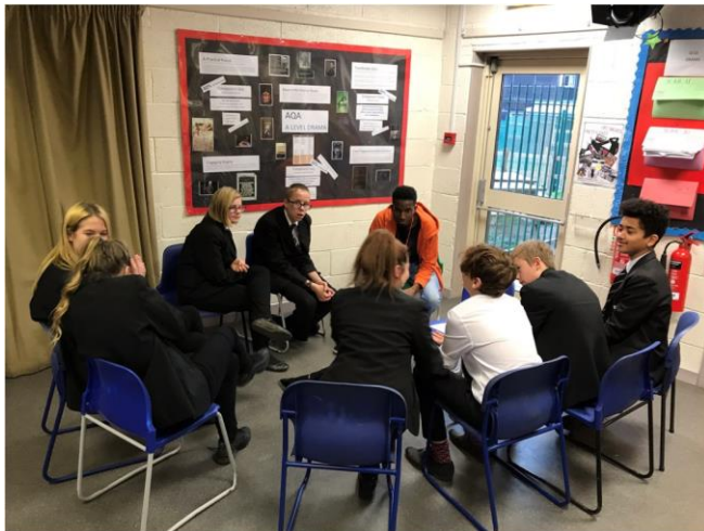
Safety workshop in a school, Eastern Region

Visit schools to provide safety education to young people. Use our educational resources to do so.