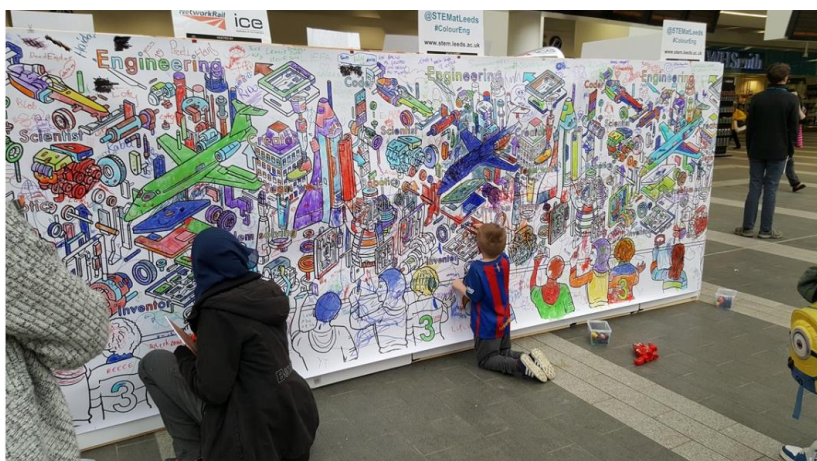
STEM activities at a station

Organise STEM activities in public locations.