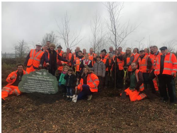
Members of the local Hadley Wood community, Tree Council and Network Rail at tree planting

Work with an environmental charity. For example, Tree Council .