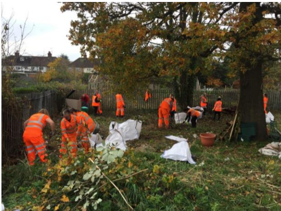
Network Rail volunteers clearing up Copsewood Road community garden in Watford

When working on land, leave it in a better condition than you arrived on it. For example: by clearing litter, by replanting appropriately.