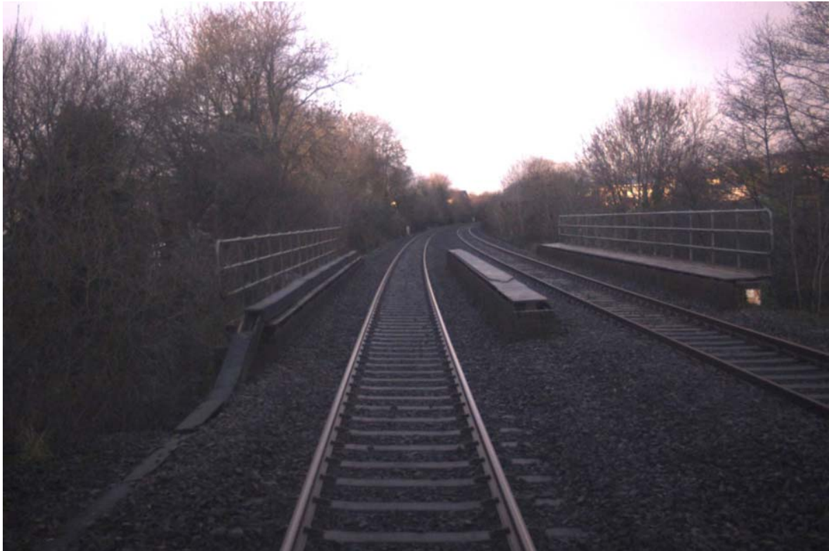
Library image of Maesyfelin bridge