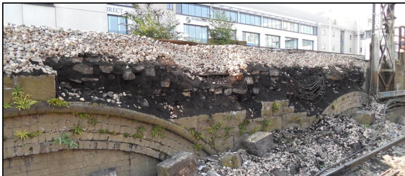
Figure 1: Structural Collapse of bridge spandrel wall at CEJ 0m09 1/2ch, Cardiff

To ensure that the potential impact of other disciplines work on structures assets are understood over both the long and short term.