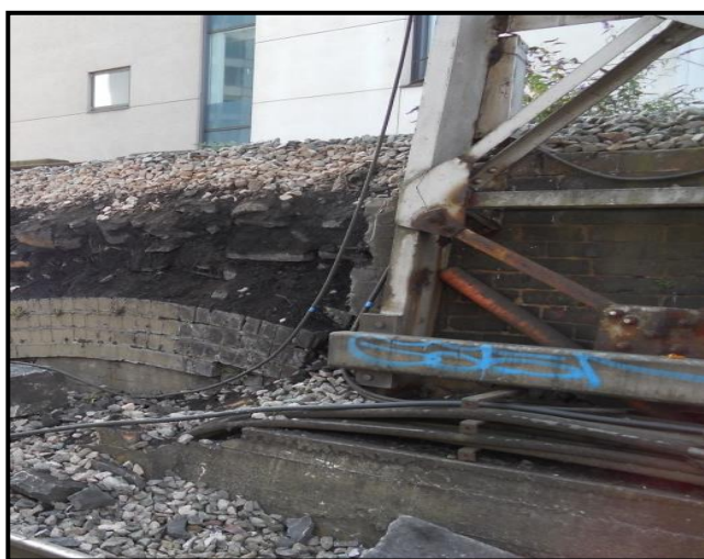
Figure 2: Modification of the spandrel wall to accommodate the signalling gantry

The investigation team found that the erection of the signal gantry during the 1960s required the modification to part of the spandrel wall and connection into the adjacent Hope Street under bridge. The portal legs of the gantry are recessed into the masonry and necessitated the removal of the masonry wall and the end of the arch barrel. A brickwork wall has been built behind the portal to retain the fill material. This remained intact following the collapse and indicated that there was no continuity provided between these structures.